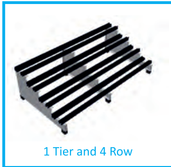
1 Tier and 4 Row