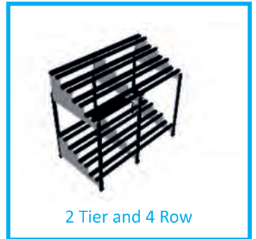
2 Tier and 4 Row