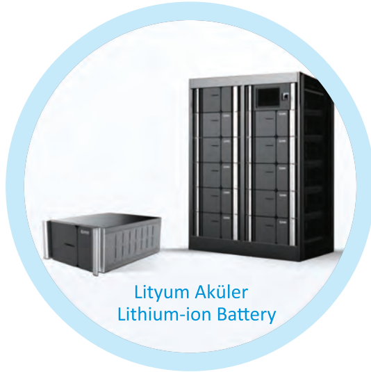
Lityum Aküler Lithium-ion Battery