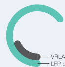
VRLA battery: 300-500 LFP battery: 4000