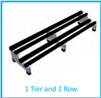
1 Tier and 2 Row

PAK 100/30 BATTERY CABINET CAN FIT 30 PCS 100AH BATTERY