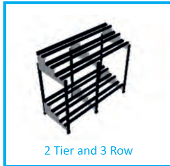
2 Tier and 3 Row